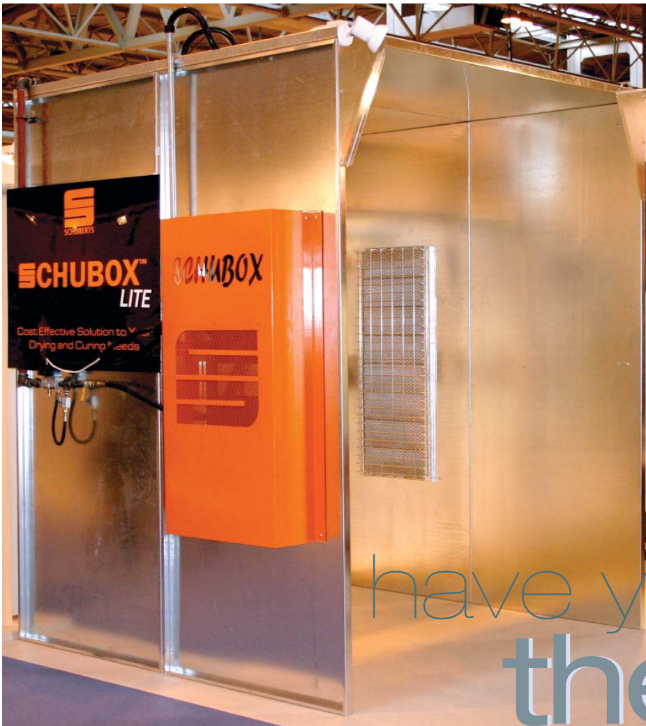
Left & below: The Schubox Lite uses ATEX certified catalytic emitters, just like the Schubox, but single skin construction in galvanised panels has enabled Schubert Technical Services to cut the cost by half.