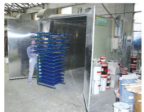
Above: Cresta's Schubox was the first Schubert Technical services supplied. It's a 3-section unit with 2 catalysts which runs on propane.

To explore unfound solutions to your finishing problems, call Schubert Technical Services on 01226 360900 or email schuberts@lineone.net