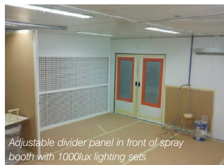
Adjustable divider panel in front of spray booth with 1000lux lighting sets