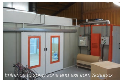
Entrance to spray zone and exit from Schubox