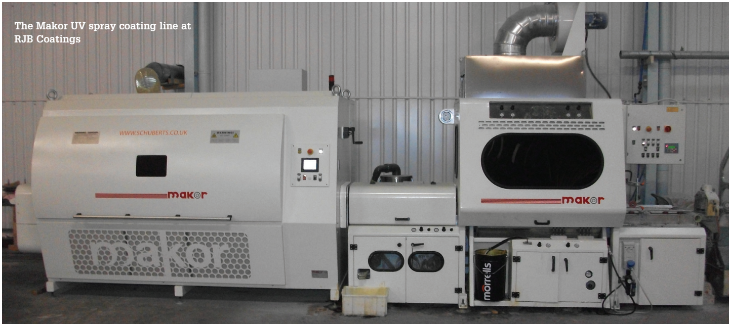
The Makor UV spray coating line at RJB Coatings

The introduction of a new UV spray coating line at RJB Coatings is being billed by the company as a unique development with the potential to boost its business and help timber trade customers in the current economic climate.